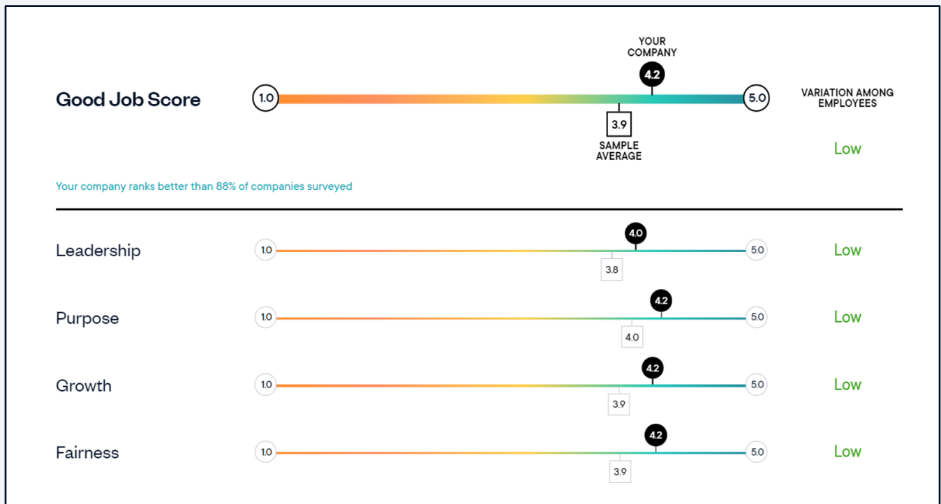
Exhibit 3. Sample Good Job Score Report

We recommend that companies and investors look for overall improvement over time in absolute terms, high performance versus competitors, and greater consistency among employee responses. (Understanding variation is important because, even if mean scores are high, an elevated variation in responses across a company could indicate that there are pockets of opportunity across different groups or departments.)